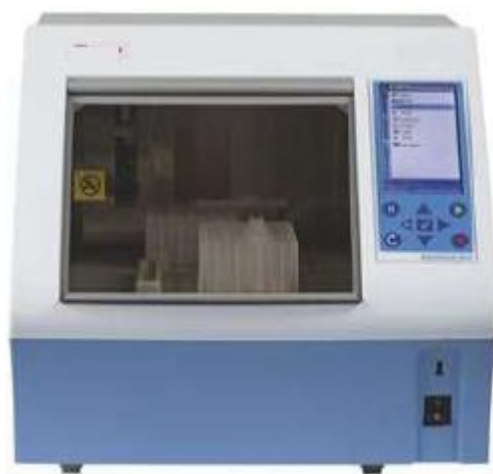
AutoMag Instrument (Cat.# 21101)

AutoMag Instrument is a low-to-medium-throughput purification system with a magnetic particle processor for DNA purification kits. With the AutoMag Instrument customers can process up to 12 samples per run with a working volume up to 1ml. In addition, it is possible to run two purification methods sequentially without interruption, raising the throughput up to 24 samples.