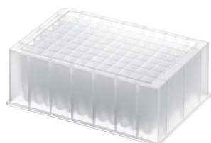
Microtiter Deep well 96 plate (Cat.# 21102)