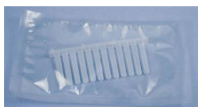
12-tip comb for 96 Deepwell plate (Cat.# 21103)